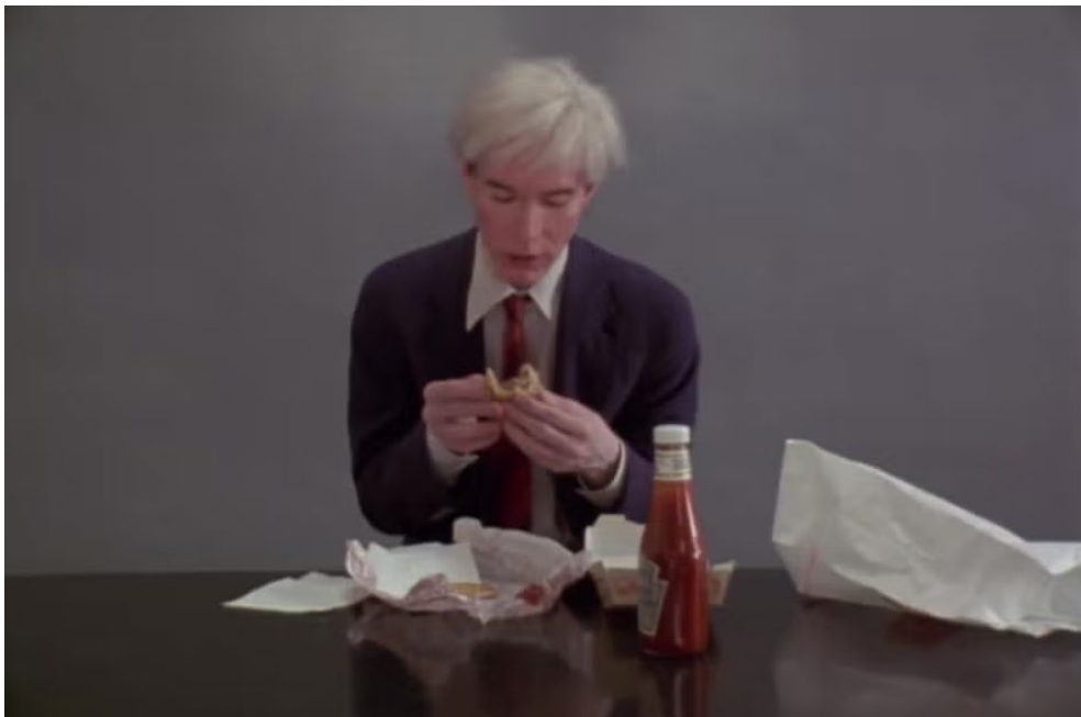
FIGURE 4. Andy Warhol Eating a Hamburger (Jørgen Leth, 1982).