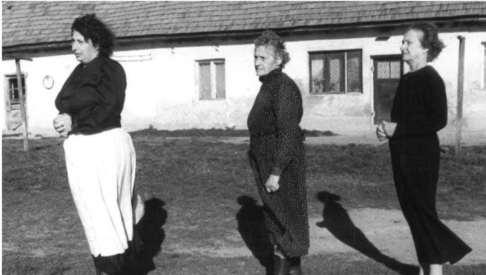
FIGURE 3. Wind ( Szél , Marcell Iványi, 1996).