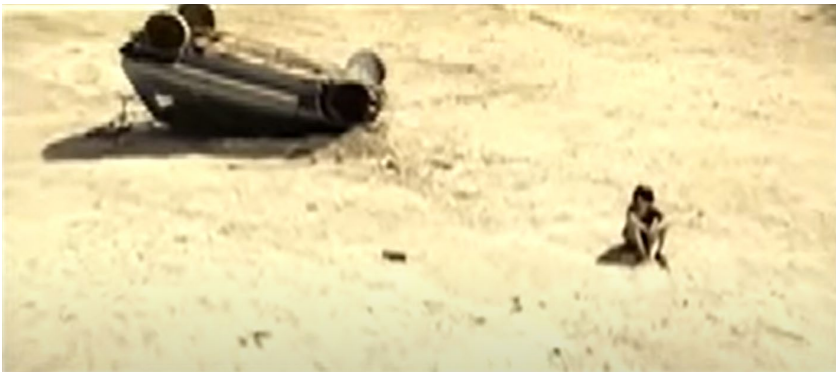
FIGURE 5. Memory of the Sea ( Recuerdo del mar , Max Zunino, 2005).